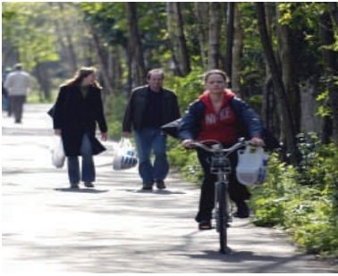
The 2nd National Active Travel Conference was held on Wednesday 13th May at Perth Concert Hall.